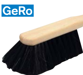
TABLE BRUSH with handle